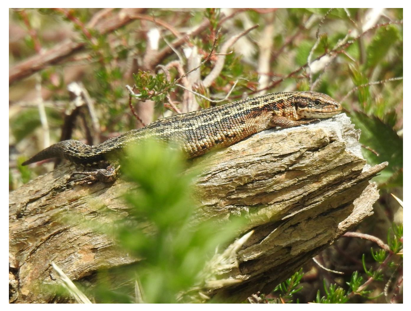
Common Lizard