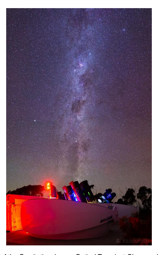
The new southern node of the Gravitational-wave Optical Transient Observer (GOTO) at Siding Spring Observatory, Australia (credit: Krzysztof Ulaczyk, University of Warwick).

AOP became a founding partner of the international project the Gravitational-wave Optical Transient Observer (GOTO) through a successful bid for funds from the Department of Culture, Arts and Leisure in January 2015. Its prime goal is to detect the optical counterpart of gravitational wave events such as the neutron star binary merger GW170817. The prototype GOTO node of telescopes was built in 2017 on the summit of the island of La Palma in the Canaries, which is one of the world's best sites to observe the night sky ( Steeghs et al 2022 ). Early in 2020 GOTO was awarded £3.2m by STFC to allow a second node to be built on La Palma and two nodes in Australia which were installed in the first quarter of 2023. GOTO is now able to image the whole observable sky every few nights and is ready for the next gravitational wave observation run made by Ligo, Virgo and Kagara which is due to start late April 2023.