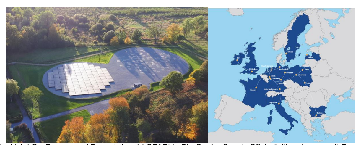
The Irish LOw Frequency ARray station (I-LOFAR) in Birr Castle, County Offaly (left) and a map of) Europe showing all the various nodes of the LOFAR network (right).

The LOFAR (LOw Frequency ARray) array observes the sky at low frequency radio waves and is therefore complementary with the Square Kilometre Array being built in South Africa and Australia which observes at higher radio frequencies. In 2016 AOP joined I-LOFAR, the Irish consortium which now includes nine partners, through capital funding from DCAL. The Irish station at Birr Castle links up with stations in ten European countries and strengthens Irish North-South collaboration and the more recent formal links made between AOP, Dunsink Observatory and Birr. It is a prime example of `big-data' science with all stations in Europe being recently upgraded to LOFAR 2.0 which allows faster data transfer and more rapid data reduction.