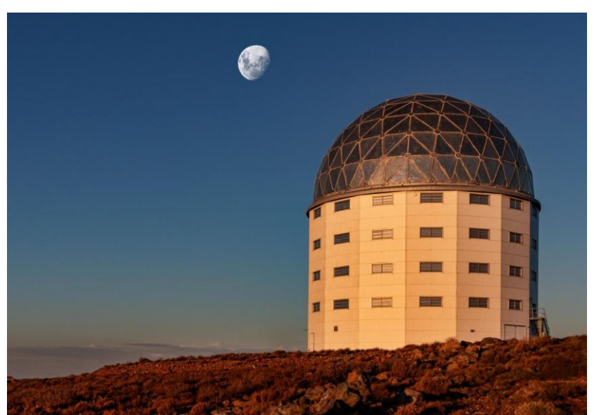
The 10-metre diameter South African Large Telescope (SALT), in the semi-desert region of the Karoo, South Africa.

The South African Large Telescope (SALT) is the largest telescope in the Southern Hemisphere, providing unparalleled access to the skies for its shareholders, of whom AOP through its membership of the UK SALT consortium is one. Participation in this major international facility brings visibility throughout the worldwide research community and allows AOP and just a few other UK universities to engage in collaborations with other SALT international partners. In turn, through such partnerships, AOP receives a return in terms of telescope time allocation that is equivalent to roughly 10 times its contribution. In 2022 alone, over 230 AOP unique astronomical observations have been made, targeting some of the most exotic stars in the Universe. These contribute to a growing series of discovery papers and to the training of postgraduate research students at AOP. Participation in SALT also allows AOP to explore opportunities through the SALT Collateral Benefits Programme to develop links between local schools in Northern Ireland and in South Africa. AOP carries out the administration function for the UK SALT consortium, which includes four other academic partners – Keele University, Open University, University of Central Lancashire and University of Southampton.